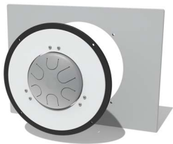
Insert can easily attach to your own panel