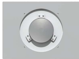
Rear view of insert attached to host panel